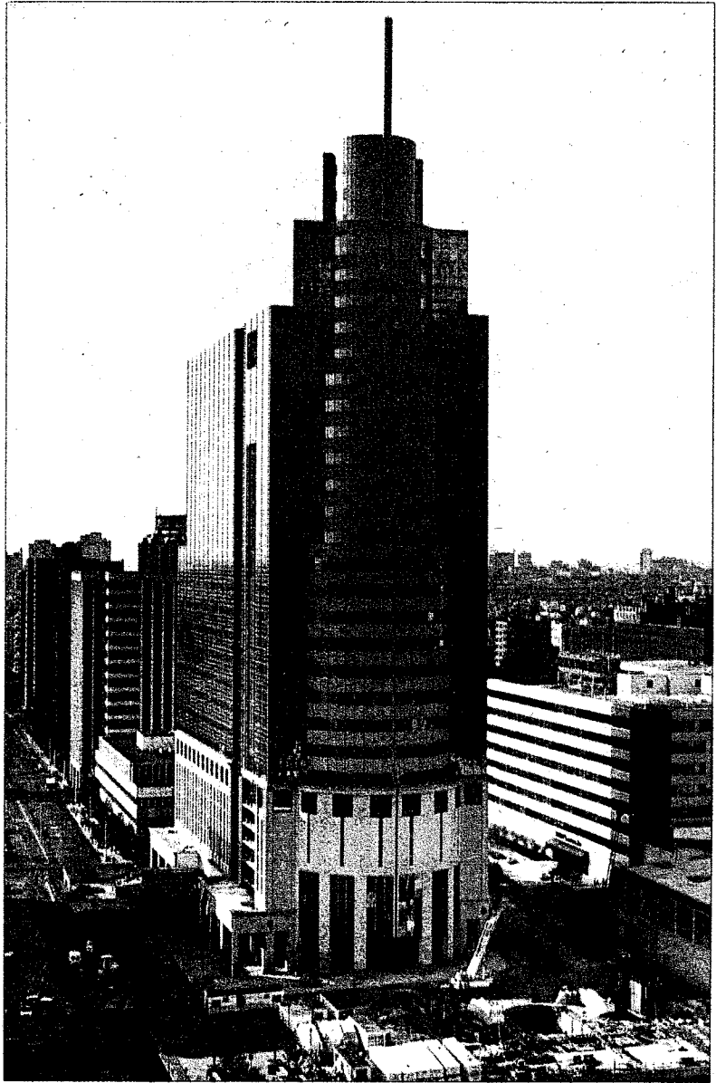
Exchange Place office tower rises over existing subway.

The top of the casing was attached with a kelly bar, and the casing was drilled in to the top of